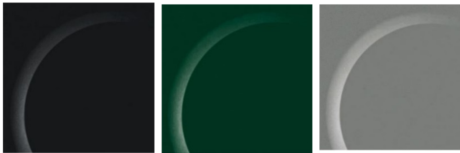
ROUND RUBBER TILE