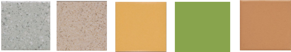
Ceramic Mosaic Tile - Floor